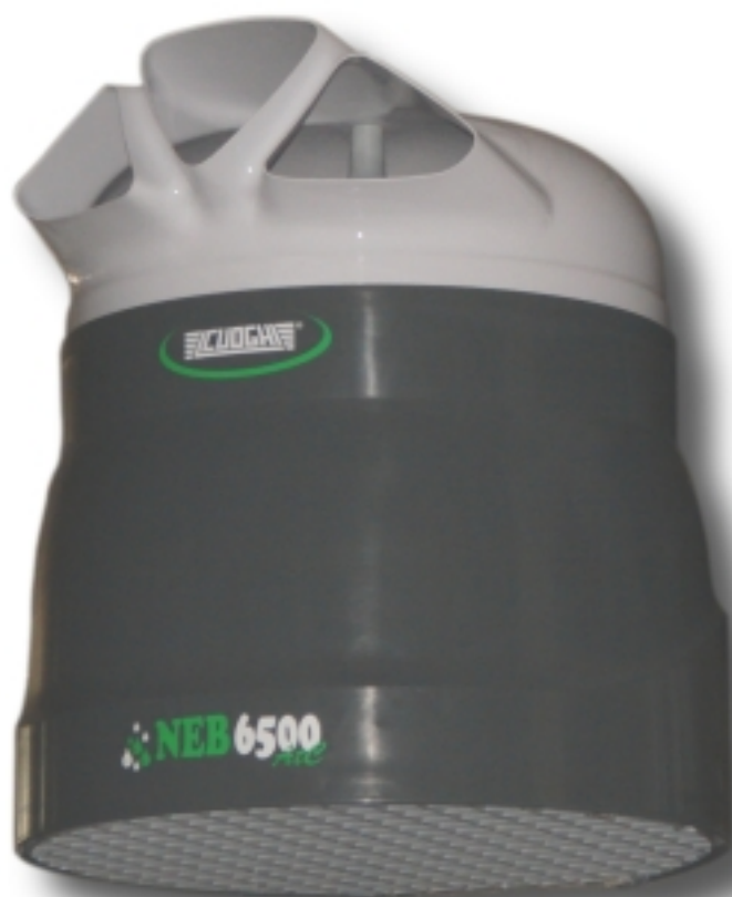
▶▶▶ HUMIDIFIER ◀◀◀