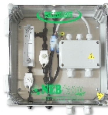
▶▶▶ EXTERNAL CONTROL BOX ◀◀◀